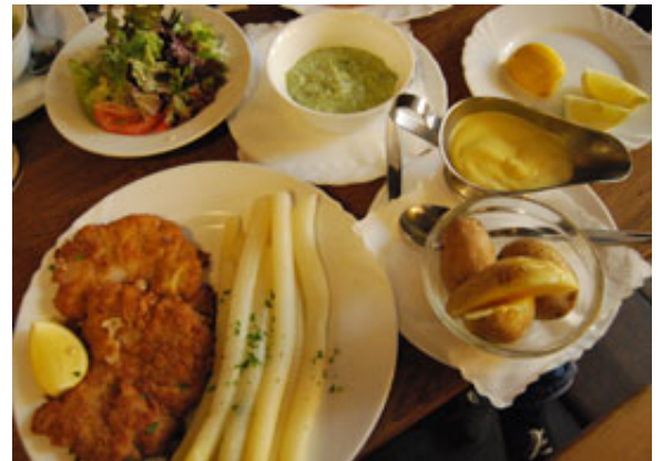
Schnitzel and asparagus with grüne sosse (green sauce)

So it was time to spend some money and across the river we went, south, to Sachsenhausen