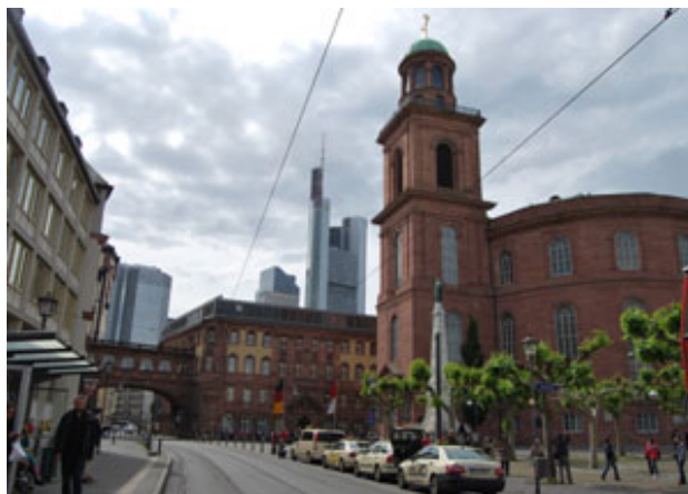
Historical buildings blend with Frankfurt's modern skyline

Frankfurt is a great starting and/or finishing point for trips within the surrounding regions. Centrally located, FRA (http://www.frankfurt-airport.com/content/frankfurt_airport/en.html) is a hub for Lufthansa, while Frankfurt Hauptbahnhof (http://www.frankfurt.de/sixcms/detail.php?id=317580) is the hub for Deutsch Bahn. It's a great walking city – ideal for a 1 or 2 day layover, yet there's plenty to see for a longer stay.