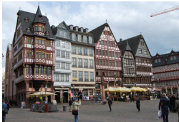
The Römerberg (the historic heart of Frankfurt)

Click here to answer (http://www.openjaw.com/travel_blog_question.php?id=12&title=stepping-out-of-the-shadows-bremen-is-full-of-surprises&day=4)